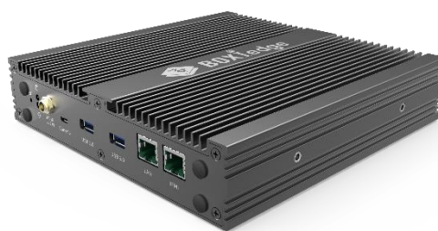
BOXiedge Fan-less server

Socionext and Foxconn have collaborated on the development of Foxconn’s BOXiedge, a high-density, fan-less, and highly efficient edge server that measures a compact 200mm x 200mm (1U) and typically consumes only 30W of power.