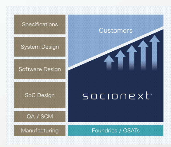
Leader in "Solution SoC"

To meet such customer needs in the fast-changing market, Socionext acts as a "Solution SoC" company that delivers differentiated SoCs by being involved from the concept stage, then proposing the optimal choices and the best combination of components in the design ecosystem. This unique business model provides our customers distinct value that many conventional ASIC providers who focus mainly on logic synthesis and physical design aren't able to offer.