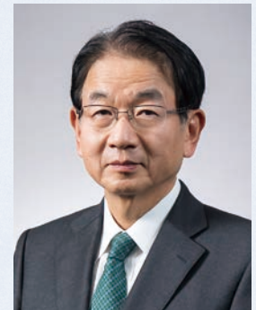
Representative Director, Chairman and CEO

Under the mission “Together with our global partners, we bring innovation to everyone everywhere”, we provide new value to our customers and beyond around the world and realize a prosperous society, as a valued partner of customers who seek unique and advanced SoCs to differentiate their new services and products, and suppliers of the latest technologies in the evolving semiconductor ecosystem.