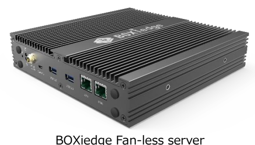
BOXiedge Fan-less server View Larger Image

Socionext and Foxconn have collaborated on the development of Foxconn's BOXiedge, a highdensity, fan-less, and highly efficient edge server that measures a compact 200mm x 200mm (1U) and typically consumes only 30W of power.