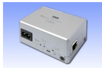
Evaluation Kit example (Click to enlarge)