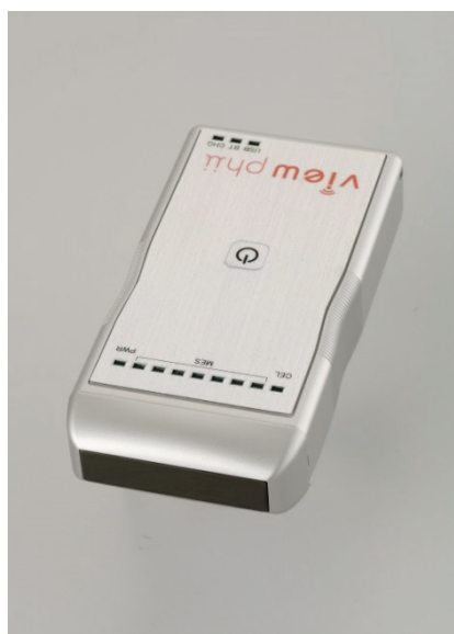
Fig. 1 viewphii handheld device

http://www.medica-tradefair.com/cipp/show_lang,2/oid,28457/xa_nr,2453508/~Web-ExDat asheet/exh_datasheet