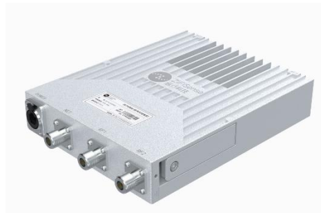
ZETA SDR Gateway from ZifiSense

When combined with the ZETA SDR gateway from ZifiSense, SC1330A delivers an excellent sensitivity of -150 to -110 dBm at speeds ranging from 100bps to 100kbps, which is approximately three times the communication speed of typical methods. Also, it supports high-speed mobile communication with a transmission speed of 600bps and a transmission power of 10dBm. Since high-speed mobile communications at 100 km/h have a coverage radius of 6 ~ 10 km, the SC1330A can meet the needs of logistics, industry, agriculture, smart cities, and construction applications.