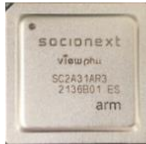
Ultrasound Imaging LSI (23mm × 23mm)