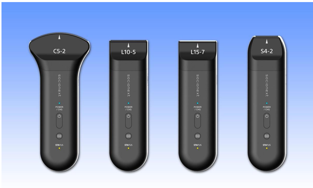
Prototypes of New Wireless Ultrasound Probe (Under Development)

For more information, visit: https://viewphii.com/en/