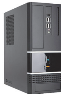
Photo: SynQuacer E Box