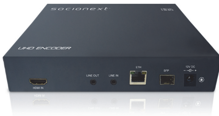
Fig.2: X500E UHD Encoder Box (Prototype)

Socionext will showcase a prototype of a new UHD encoder box `X500E' designed for live IP streaming. Based on the company's highly reliable codec SoC, X500E meets and exceeds the rigorous demands for UHD/HEVC elevated processing power, by using reduced bandwidth transport capacity whilst providing superior 4K video quality at 60fps and lowest latency.