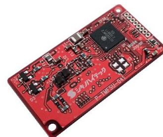
P-TMFSU-041 with SC1320A ( View Larger Image )

Shikino High-Tech has been developing, manufacturing, and delivering PLC module products for IoT communications used in embedded devices. Equipped with the SC1320A, the new P-TMFSU-041 communication module complies with the HD-PLC4 standard and achieves high-speed data communication using existing power lines. By using existing power lines, it enables to build a wired network without installing new communication cables.