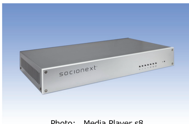
Photo: Media Player s8