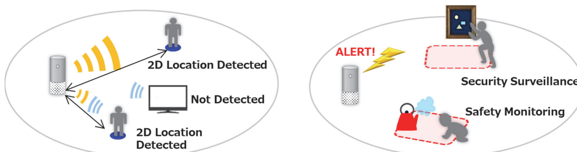
SC1221AR3 Usage Examples (detecting multiple movements / entering specific area)

This sensor is ideal for two-dimensional motion detection. It incorporates a 1x4 linear array receiver antenna to detect azimuth, speed and distance of multiple moving objects. Although the angle detection is only available in the azimuth direction, it is two times more precise than SC1220AT2, which is suitable for detecting a person entering a specific area.